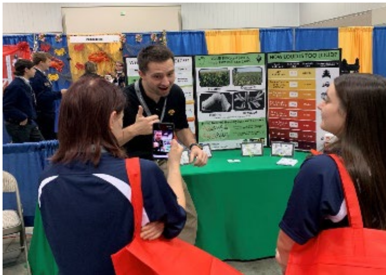
Example of a table display at the 2019 National FFA Convention