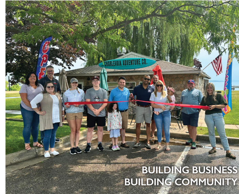
BUILDING BUSINESS BUILDING COMMUNITY

To support commerce and provide leadership to enhance the quality of life.