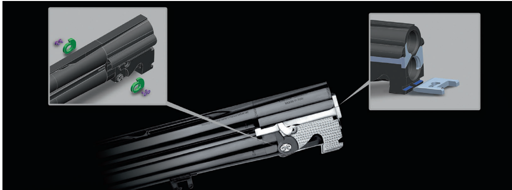
THE INVICTUS CAMS ELIMINATE CONVENTIONAL HINGE PINS AND TRUNNIONS. THIS SYSTEM MAKES THE INVICTUS THE FIRST DOUBLE GUN THAT CAN MOVE THE RELATIONSHIP OF THE BARRELS TO THE ACTION. THIS ALLOWS THE BARRELS TO BE MOVED REARWARD TO ELIMINATE ANY POTENTIAL 'OFF FACE' CONDITION.