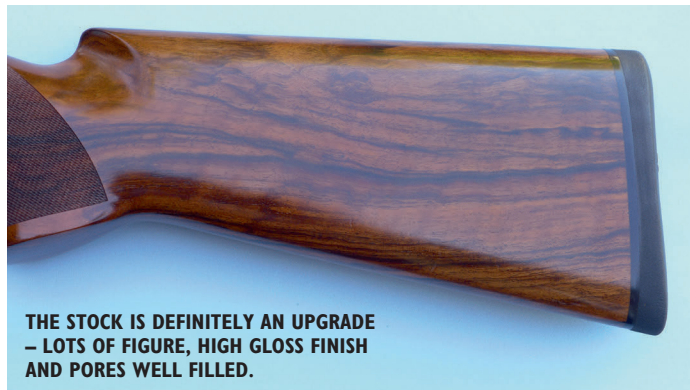
THE STOCK IS DEFINITELY AN UPGRADE – LOTS OF FIGURE, HIGH GLOSS FINISH AND PORES WELL FILLED.

Considering the side plates, the intensive engraving, the wood upgrade, the quality checkering, the replaceable Invictus Block and the gun’s durability, there’s a heck of a lot of value in this gun at $8795. Invictus is a Latin word meaning ‘invincible’ – this shotgun is aptly named. ■