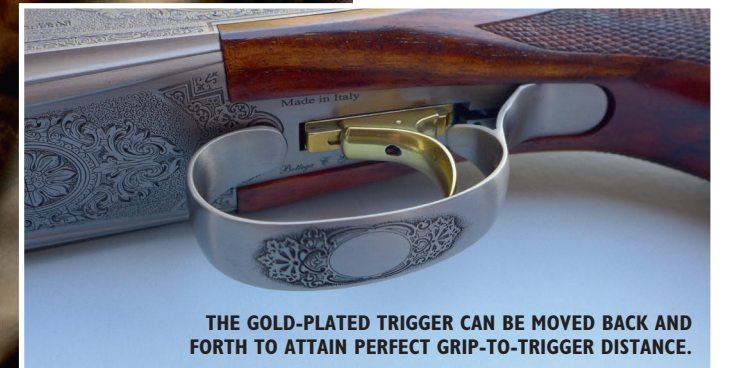
THE GOLD-PLATED TRIGGER CAN BE MOVED BACK AND FORTH TO ATTAIN PERFECT GRIP-TO-TRIGGER DISTANCE.

The Invictus V incorporates a new trigger system, named the DPS2. I found it extremely light, and so did others I had shoot the gun. There's also a crispness and speed that competition shooters will love. On my Lyman Digital Trigger-Pull Scale the trigger went