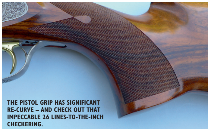
THE PISTOL GRIP HAS SIGNIFICANT RE-CURVE – AND CHECK OUT THAT IMPECCABLE 26 LINES-TO-THE-INCH CHECKERING.