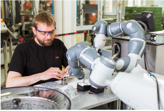
Fig. 2: An example of human-robot collaborative manipulation in a productive environment (image courtesy of ABB received from www.abb.cz ).

standing the wide margin of applications, collaborative tasks that involve simultaneous interaction with rough or uncertain environments (e.g. co-manipulative tool-use) can induce various unpredictable force components to the sensor readings [Peternel et al., 2014]. This can significantly reduce the suitability of such an interface in more complex interaction scenarios since it can be difficult to distinguish the components related to the active counterpart(s) behaviour from the ones generated from the interaction with the environment.