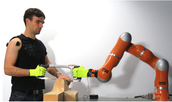
Fig. 3: Authors in [Peternel et al., 2016b] proposed a human-robot co-manipulation framework for robot adaptation to human fatigue. The myoelectric interface provides the robot controller with a feedback about human motor behaviour to achieve an appropriate impedance profile in different phases of the task. The human fatigue estimation system provides the robot with the state of the human physical endurance.

A remarkable use of bio-signals in the development of HR interfaces is to estimate the human physical (e.g. fatigue) or cognitive (anxiety, in-attention, etc.) state variations that might deteriorate the collaborative robot'(s) performance. The authors in [Rani et al., 2004] developed a method to detect human anxiety in a collaborative setup by extracting features from EMG, electrocardiography (ECG) and Electrodermal responses. In a similar work, the human physical fatigue was detected and used to increase the robot's contribution to the task execution [Peternel et al., 2016b].