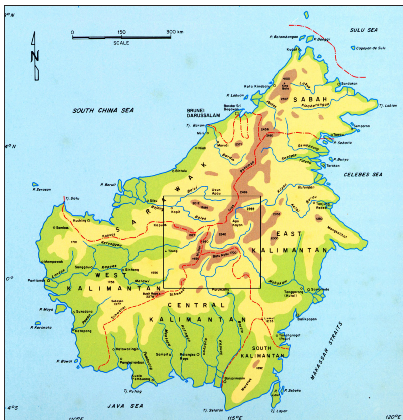
Map 1. The island of Borneo and the area of the Müller and Schwaner mountains.

This paper 2 presents data on a cluster of little-known ethnic groups of one of the most remote regions of interior Borneo, the Müller and northern Schwaner mountain ranges (see Map 1). The data were collected mainly in the period 1975-1985, during which the first writer spent about three years in that area, with additional data gathered in the course of several visits in more recent years. Among other things, historical and linguistic data were collected and were analysed in the early 1980s (for example, Sellato 1982a, 1986).