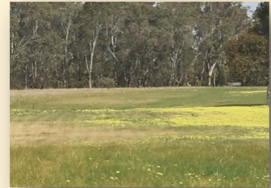
Note the density of Capeweed on the regularly mowed area, compared to the lesser mowed native grass area.