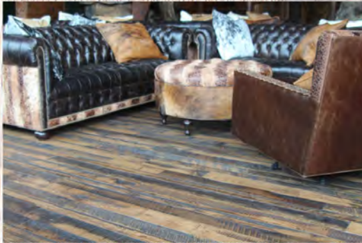
Reclaimed Skip Face Wide Plank Flooring – Private Res.