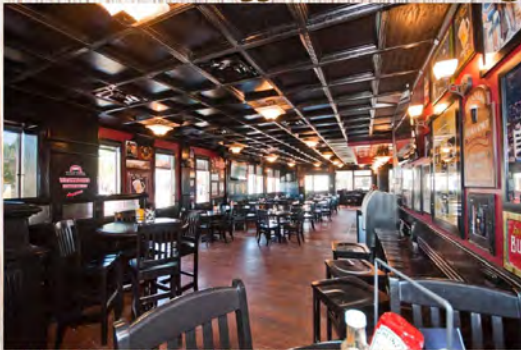
Custom Color Black Ceiling Restaurant Bar - Canada