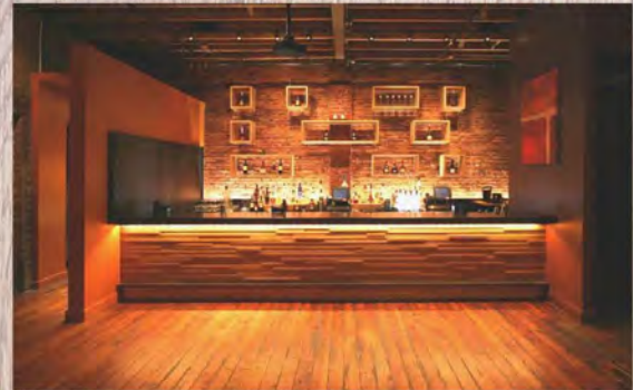
Oak WoodStone Panel on a bar front and Reclaimed Wood Flooring WoodStone Wall Panels are made from 50% Post Consumer & 50% Post Industrial Recycled Content!