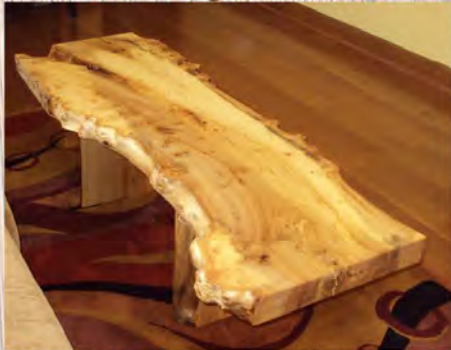
Natural Live Edge Coffee Table