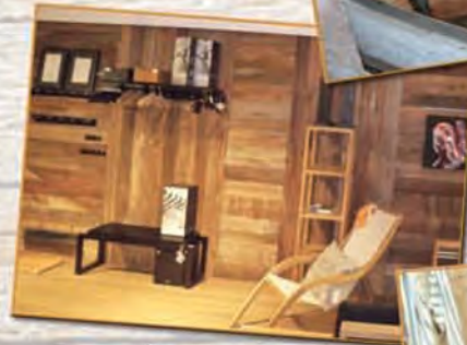
Rustic Wall Panel System