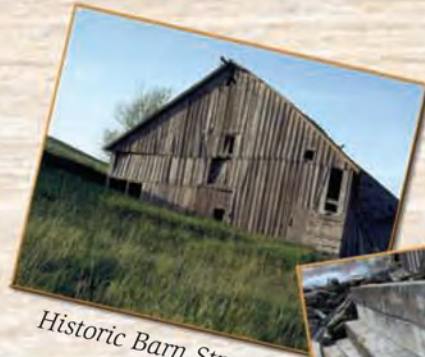
Historic Barn Structure