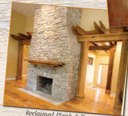
Reclaimed Plank & Beams