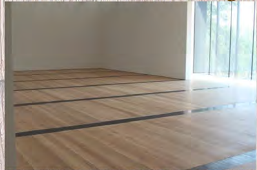
6"wide x 9'-0"long Rift and Quartered White Oak Plank Flooring with VOC Free Oil Finish St. Louis Art Museum