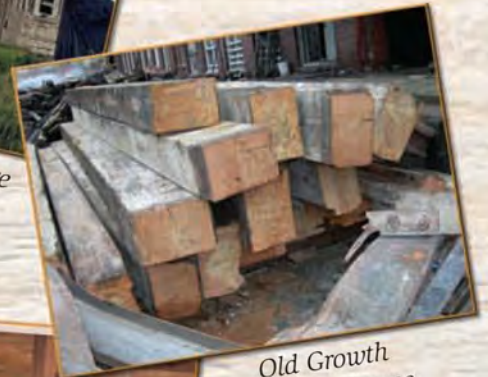
Old Growth Massive Beams