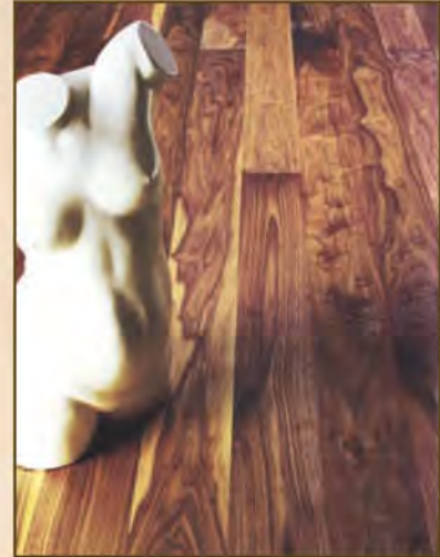
Walnut Wide Plank