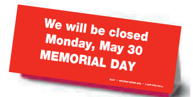
#6- Table Tent

*The Sign Samples Do Not Depict 2025 Year Holidays.