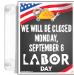
Vertical 8.5"W x 11"H Item #21

Please email us for shipping prices at gaildoyle@holidaysignsusa.com