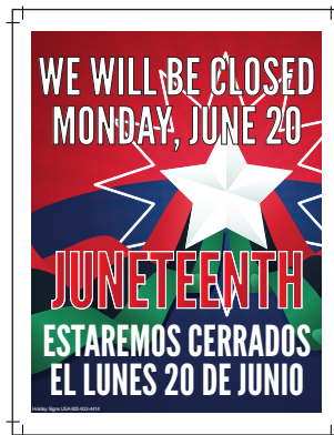
#5- Vertical - English/Spanish