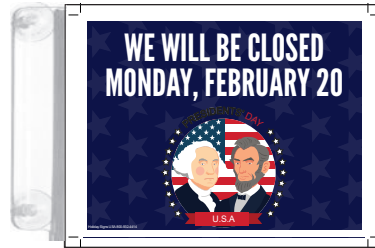
Horizontal 11"W x 8.5"H Item #20