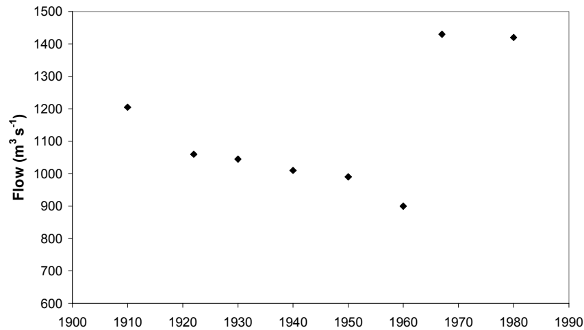
Fig. 2.1 Rating changes for Bahr el Jebel at Mongalla; flow corresponding to the gauge level of 12.25 m.

at sites with mobile beds are likely to change from flood to flood; the simultaneous study of a number of years of measurements should make it possible to date changes and to monitor progressive movements of bed controls. An example of such progressive changes is illustrated in Fig. 2.1, where successive discharges of the Bahr el Jebel at Mongalla in the southern Sudan, corresponding to a gauge level of 12.25 m, reveal changes of rating which are consistent with measured bed levels.