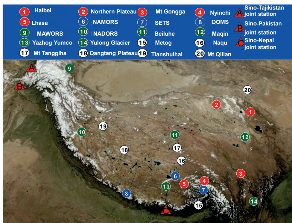
Fig. 1 The station layout in the TPE Programme.

There will be 23 comprehensive observation and research stations in the TPE (Fig. 1). Eleven of them will be managed by the Institute of Tibetan Plateau Research, Chinese Academy of Sciences (ITP/CAS). They will be configured for the study of atmosphere–land interaction. The six constructed stations are: Nam Co Station for Multi-sphere Observation and Research (NAMORS, 30.46°N, 90.59°E; elevation: 4730 m; land-cover: sparse meadow), Qomolangma Station for Atmospheric and Environmental Observation and Research (QOMS, 28.21°N, 86.56°E; elevation: 4276 m; land-cover: sparse grass-Gobi), Southeast Tibet Station for Alpine Environment Observation and Research (SETS, 29.77°N, 94.73°E; elevation: 3326 m; land-cover: grass land), Ngari Desert Observation and Research Station (NADORS, 33.39°N, 79.70°E; elevation: 4270 m land-cover: grassland), Muztagh Ata Westerly Observation and Research Station (MAWORS, 38.41°N, 75.05°E; elevation: 3650 m; land-cover: sparse grass-Gobi desert) and Naqu Station (Naqu, 31.37°N, 91.90°E; elevation: 4509 m; land-cover: sparse meadow). Qangtang Plateau Station, Metog Station, Sino-Tajikistan joint station, Sino-Pakistan joint station and the Sino-Nepal joint station will be established by ITP/CAS by the end of 2017.