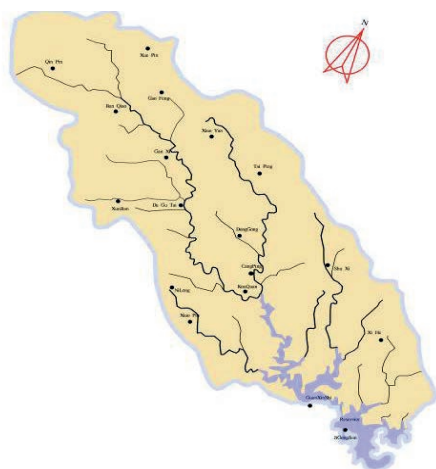
Fig. 1 The sketch map for ZhangHe Catchment.

greatly; their rise time is short. The hydrological monitoring network in the basin is homogeneous (Fig. 1). These may help the study of short-term flood forecast.