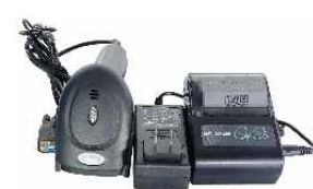
Optional scanner & printer