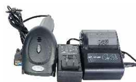
Optional scanner & printer