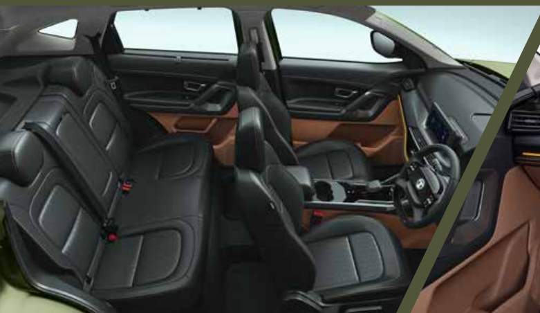
PERSONA THEMED INTERIORS