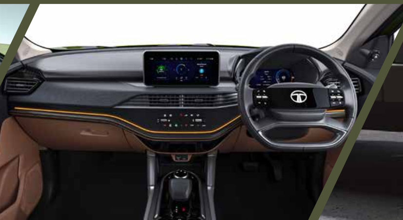
THEMED DASHBOARD WITH MOOD LIGHTING