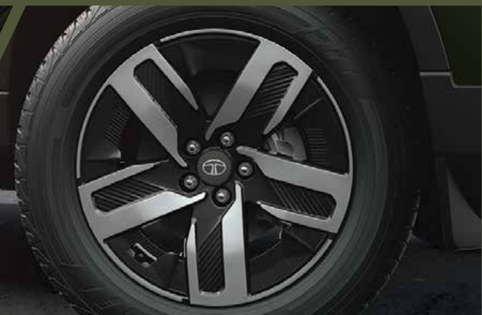
R18 ALLOY WHEELS WITH AERO INSERTS