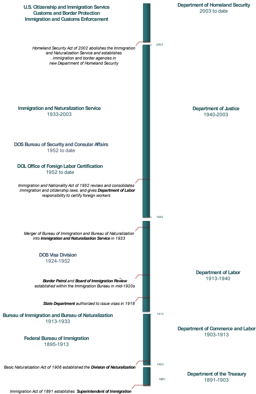
Figure 1. Timeline of Immigration Governance in the United States