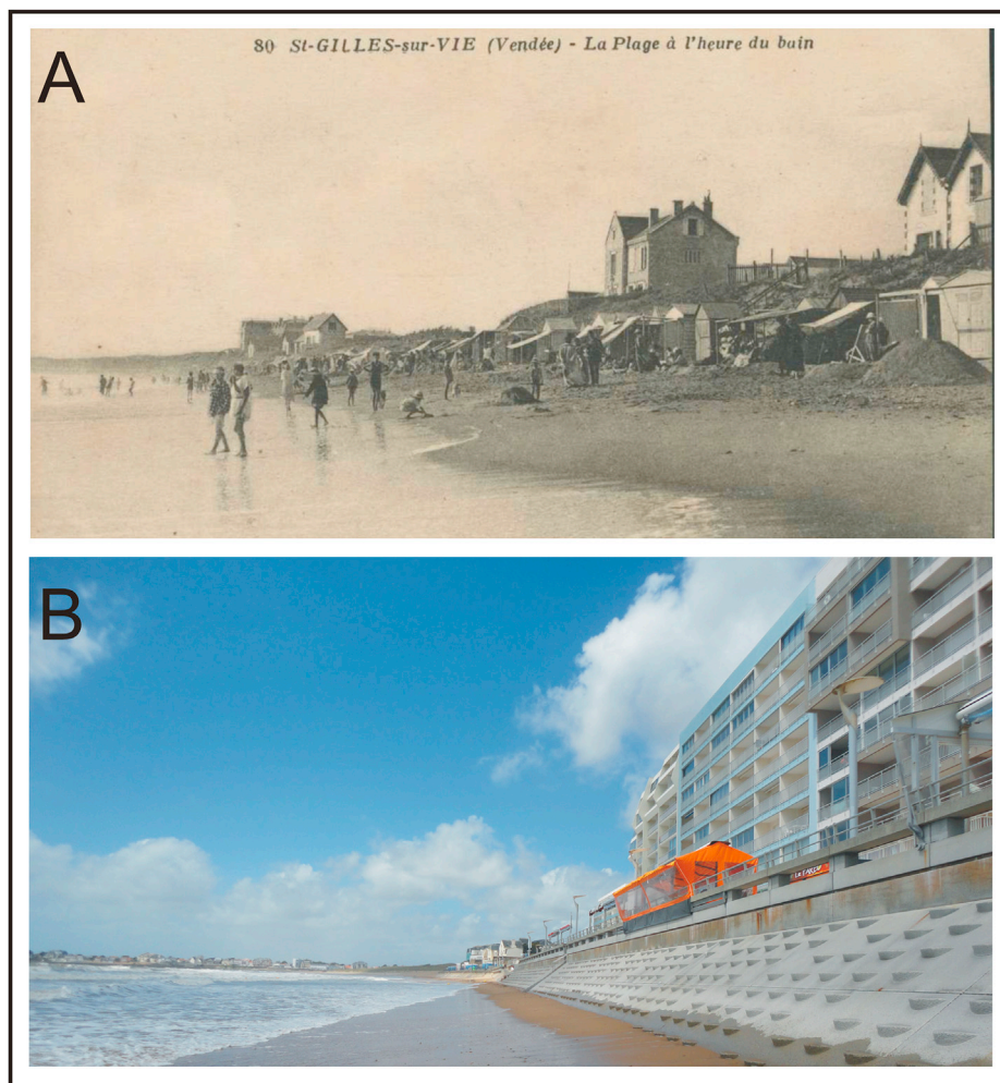
Fig. 3. (a) Image of the beach of St-Gilles-sur-Vie (Point de la Garenne), near La Faute-sur-Mer (Vendée) in the 1920s. The natural dunes have already been partially levelled to build villas (e.g. Villa Notre Dame in the background), while beach huts are installed for the bathers.; (b) the same spot in 2017: the area is now fully urbanized and a sea-wall was built to protect the promenade behind.

or changes in land-use. The use of long historical records may allow scientists to better define the occurrence and recurrence of storms over a centennial sample. From an engineering viewpoint, the concept of the probability of occurrence (e.g. the return period) is based on a data series frequency analysis, often limited to datasets of 30 years or less, being the obtained geometric distribution often extended to allow for changing