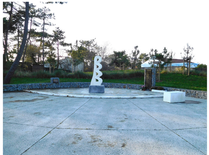
Fig. 4. Stele set up by the association of the victims of La Faute-sur-Mer with a plate on which the names and surnames of the Xynthia storm victims are engraved.

In particular, former societies used the network of bell towers of churches to alert the populations of the islands and the mainland, almost in real time. Whereas recent catastrophes have shown that modern networks of information (internet, mobile telephone) are liable to failure under the high usage levels generated at the time of extreme events, the