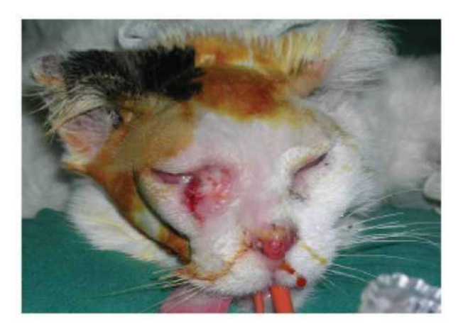
Figure 1 Pre-operative image of the FISS. An adequately wide surgical excision of the FISS would have led to the removal of the majority of both lids, the enucleation of the eye and reconstruction by a caudal auricular axial pattern flap or a superficial temporal axial pattern flap. The nasal planum is still erythematous, but no erosions, which were observed before treatment, are evident. The nasal deformity is a result of both the tumour erosive behaviour and the drug infiltration

monomorphic population of spindle cells immersed in an abundant hyaline matrix. The cells were characterised by indistinct borders, abundant cytoplasm and one paracentral nucleus with 1-2 prominent nucleoli, and a low mitotic index. A small central necrotic area and peripheral multifocal inflammatory infiltrates were present. Moderate and diffuse chronic inflammation was also visible in the perinodular dermis. The final diagnosis of a well-differentiated fibrosarcoma was confirmed with immunohistochemical staining for vimentin (monoclonal mouse anti-vimentin, diluted 1:50, DakoCytomation) and cytokeratin (monoclonal mouse anti-human cytoker-atin clone AE1-AE3, ready to use, DakoCytomation) (Figure 3a, b). No further treatment was proposed.