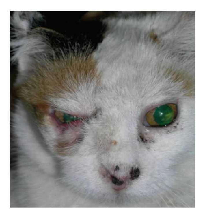
Figure 2 Clinical characteristics of the cat 1.5 months after surgery. Although the hair regrew near the eye, the cat did not seem to have any ocular problems. The crusty lesions of the nasal planum remained similar to the ones visible in the photograph for the rest of the cat's life.

Examinations of the nasal and periocular areas were planned every month for the first 3 months, and every 3 months thereafter, and radiographs of the thorax were planned after 6 months. The FISS recurred locally 10 months after surgery. The owner declined any further therapy and the cat was euthanased a few days after the last examination. Necropsy was not allowed; therefore, no information is available regarding the presence of metastasis, with the exclusion of the lungs and regional lymph nodes, which were clean on radiographs and at the clinical examination, respectively.