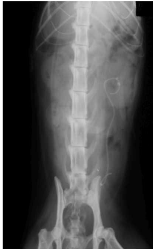
Fig. 2. Dorsoventral radiographic view of a ureteral stent. Two stones in the renal pelvis were left in place (cat 3).

Median interval between presentation at the clinic and surgery was 3 days (range 0-11 days). Preoperative treatment consisted of Ringer's lactate IV only. Ureterotomy for ureterolith removal was performed in eight cats. Two of the eight cats were also admitted for surgery because of concomitant ureteroliths and ureteritis that were interpreted as early stage obstruction, even though a proximal ureteral dilatation indicating obstruction was not clearly demonstrated at the preoperative ultrasound. Mineral analysis revealed seven oxalate ureteroliths and one struvite ureterolith. In the five cats with unremoved nephroliths, stones spontaneously migrated into the ureter along the stent without causing further obstruction (Fig. 3; cat 3) and were eliminated during urination. Cat 8 presented a 3 mm mural obstruction in the proximal third of the ureter and underwent a 1 cm ureterectomy, stenting, and end-to-end ureteral anastomosis. Histopathology of the excised tract revealed an unspecific chronic fibrosing ulcerative ureteritis.