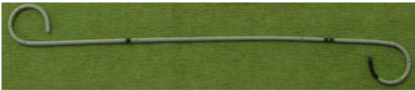
Fig. 1. Number 3 French paediatric ureteral double J stent.

If there were difficulties with stent insertion, the ureter was amputated distally (for small papillae) or just distally to the obstruction (if the post-obstructed ureter had reduced luminal diameter), spatulated and re-implanted into the bladder according to either the Lich-Gregoir or the modified Leadbetter-Politano techniques (Mehl et al., 2005). All the procedures involving ureters were performed using an operating microscope. Correct stent placement was assessed with an intra-operative radiograph (Fig. 2). Chemical analysis of removed stones was performed.