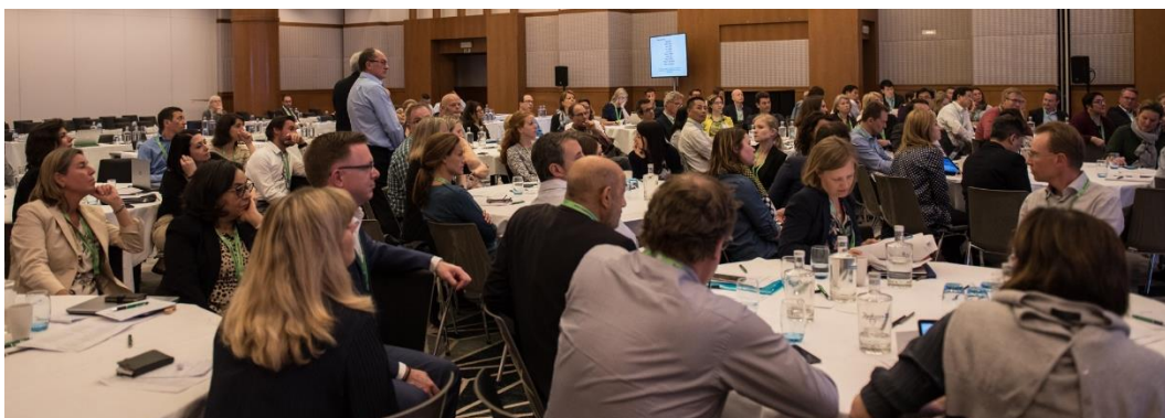
ISAPP Plenary Sessions – Radisson Blu Hotel, Antwerp, Belgium

ISAPP held its 18th annual meeting in Antwerp, Belgium May 14-16 th 2019. The meeting brought together 175 scientists from 32 countries. In attendance were 72 industry representatives, 55 invited experts, and 48 members of the ISAPP Students and Fellows Association. The meeting program included several different types of sessions, including: