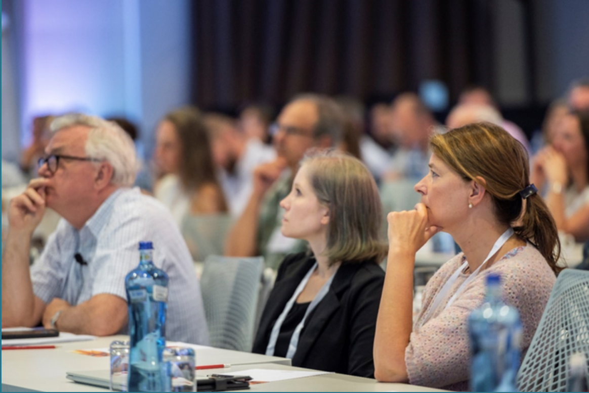
ISAPP Plenary Sessions – Dolce Hotel, Sitges, Barcelona, Spain

ISAPP held its annual meeting in Sitges, Barcelona, Spain June 15-17, 2022, celebrating 20 years of bringing together multidisciplinary scientists in probiotics, prebiotics and related fields. A group of 157 scientists from 23 countries attended: 80 industry representatives (Industry Advisory Committee – IAC - members), 54 invited experts and ISAPP board members, and 23 members of the ISAPP Students and Fellows Association.