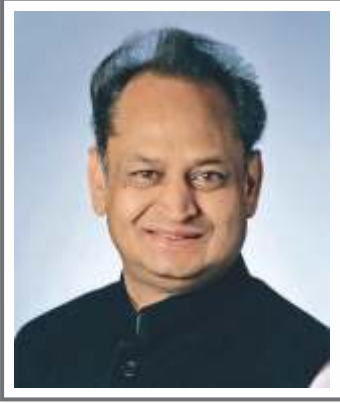
ASHOK GEHLOT Chief Minister, Rajasthan

I am glad to know that the Rajasthan Industrial Development Policy- 2019 is being released at MSME Conclave 2019 to be held at Birla Auditorium, Jaipur to mark the completion of one year of the State Government.