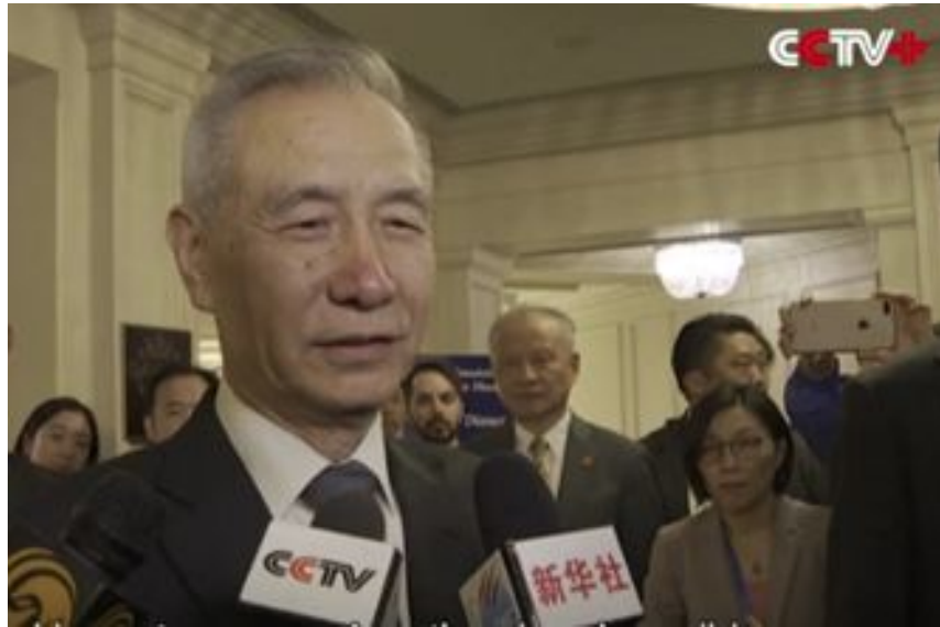
Image: PRC Vice-Premier Liu He, the lead Chinese negotiator in recent U.S.-China trade talks, speaks with reporters upon his May 9th arrival in Washington. Negotiations formally broke down the next day with the U.S. announcement of another major round of tariffs on Chinese-made goods.

However, there were rumblings of trouble when the PRC delegation arrived in Washington, D.C. on May 9th for another round of talks. Beijing's intent to reassert centralized role in the trade dispute was signaled by the fact that, for this new round of talks, Liu He was stripped of his previous designation as Xi's "special envoy" ( CNBC , May 9). This possibly indicated that Liu and his team of negotiators had stepped beyond the comfort zone of the top CCP leadership, and that Liu's room for maneuver in negotiating a deal was to be significantly curtailed.