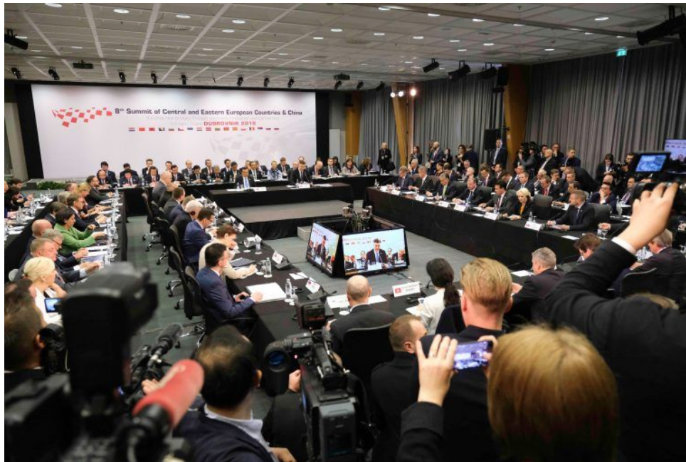
Image: Greek Prime Minister Alexis Tsipras speaking at the CEEC-China (“16+1”) Summit in Dubrovnik, Croatia, April 12, 2019.

consideration. The joint understanding of the Greek and Chinese governments was subsequently presented to the 16 European members for the purpose of notification and consultation—but in reality, Beijing's acceptance was the decisive factor in allowing the Hellenic Republic to join the format. [5] Unlike other prospective members—such as Austria between the Belgrade and Suzhou summits, or the Republic of Moldova in an earlier period—Greece has been welcomed as a full member of the initiative. This was done without offering any explanation, or an intelligible blueprint for further admissions into the club, which has raised an additional layer of opacity upon the quasi-institutional mechanisms of the initiative. As was intended from the beginning, China is actually running the 16+1 (now 17+1) show.