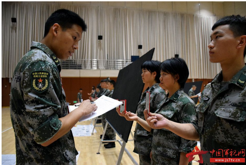
Image: PLA Strategic Support Force personnel present identification at a muster prior to the "Zhuhun-2018" [铸魂-2018] training competition.

Another aspect worth highlighting is the critical role of the SSF in enabling joint operations. The SSF aspires to be the PLA's "information umbrella" ( xinxi san , 信息伞), integrated throughout the full cycle of land, sea, air and missile force operations, from start to finish ( People.cn , January 24, 2016).