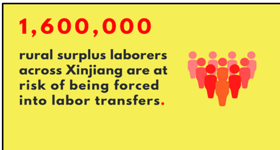
Figure 1: Based on the author's calculations, up to 1.6 million and around 60 percent of rural surplus laborers across Xinjiang are at risk of being coerced into forced labor under the ILO definition. See Section 2.7 and endnote 62 of this report for more details.

An independent legal analysis of the new evidence presented in this report—which was peer reviewed by four leading experts on international criminal law—states that there are “credible grounds to conclude” that Xinjiang’s labor transfer program meets the criteria of two Crimes Against Humanity under Article 7 of the Rome Statute (see Appendix B). [1] The program violates first the Crime Against Humanity of Forcible Transfer (Article 7 (1)(d)), which relates to safeguarding the “protected interests and rights of persons to ‘live in their communities and homes’” (Appendix B, Section B.1); and second the Crime Against Humanity of Persecution (Article 7 (1)(h)).