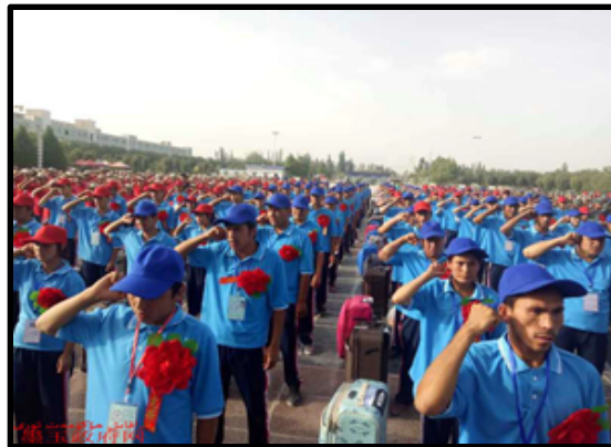
Figure 5: Rural surplus laborers from Karakax (Moyu) County are sent to labor in Urumqi and Wujiaqu on June 19, 2017 after undergoing “strict political review, physical examination, selection, and pre-job training”.

According to the Nankai Report, the state is still “carefully screening” Uyghurs, and “those with problems” are being “resolutely dealt with,” while those “without problems” are “being trained.” The Report emphasizes that laborers transferred to other provinces undergo stringent political vetting that typically precludes the participation of formerly detained or imprisoned persons (lit. “two types of people” 两类人员, lianglei renyuan ), and likely also precludes “graduates” from vocational internment.[26]