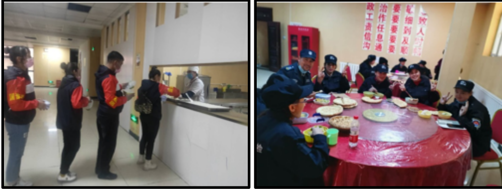
Figure 9, 10: Transferred laborers receive food from the company cafeteria (9, left), and eat meals alongside security staff (10, right). According to one company’s promotional materials, such care and oversight is designed to “implement the poverty alleviation policy, but also to enable the employees to fully feel the warmth of our company family.

Transferred laborers to Suzhou Province are accompanied by officials who “manage” them and are under “paramilitary management” at the factories to ensure that they work in a “disciplined” and “organized” fashion ( Huanqiu , August 29, 2019). A state media report of laborers transferred from Aksu to Wufang Optoelectronics Company in Hubei Province says that managing cadres use rest times to “perform thought work” and “talk heart-to-heart” to ensure laborers’ moods and spirits are stable ( Aksu Daily , July 31, 2019).