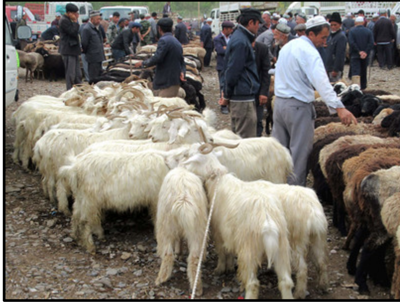
Figure 11: A photo of a livestock market northwest of Kashgar, taken on September 17, 2017. The Nankai Report observes that the scale of “centralized, large-scale management of livestock and land” has dramatically increased, facilitating subsequent labor transfers.

The government has embarked on an all-out campaign to enforce the land transfer scheme. In 2019, a region in Qinghe County, Altay Prefecture mass-converted pastoralists to laborers by “liberating 90 percent of the village’s labor force from grazing” through herd trusteeship ( Altay News Online , July 16, 2019; compare with Xinjiang Daily , August 30, 2019). Following “vigorous promotion,” 59,000 households in Aksu had transferred 154,500 hectares of land to such centers by November 2020, resulting in the labor transfer of 73,300 persons ( Aksu Daily , November 24, 2020). Such drastic livelihood changes are unlikely to be due to voluntary choice. A study published in July 2020 that surveyed rural surplus laborers in Kalpin County found that only 23 percent of respondents were “willing” participate in the land caretaking scheme, 47 percent were “unwilling”, and 30 percent were “unsure.” [70] A 2018 government report from Bayingol Prefecture describes the momentum behind such coercive land transfers: