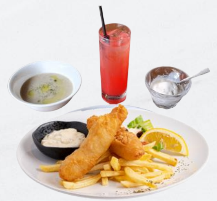
Battered Fish & Chips Set with Cream of Forest Mushroom Soup & Turkish Ice Cream