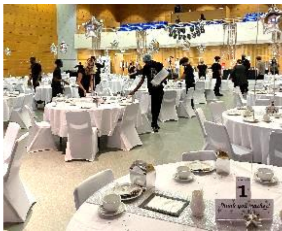
Boothroyd Hall preparation