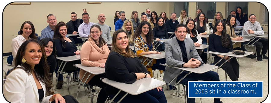
Members of the Class of 2003 sit in a classroom.