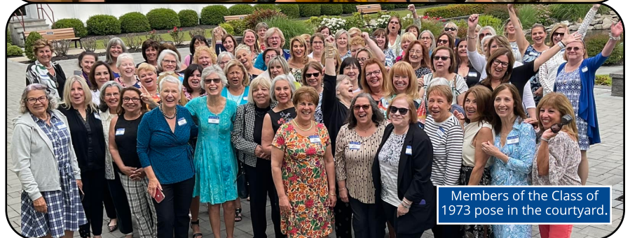
Members of the Class of 1973 pose in the courtyard.