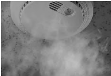
[ fire restoration ]

Naturally deodorizes. Authorized for use under the USDA inspection program. Nontoxic. Biodegradable.