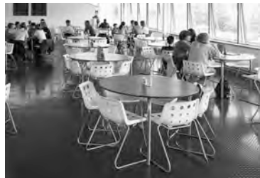
[ hard surfaces ]