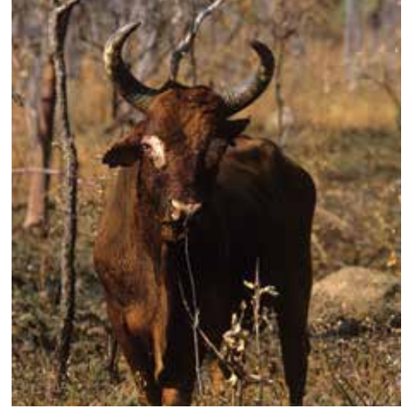
Above Feral cattle eat plants and degrade habitat.