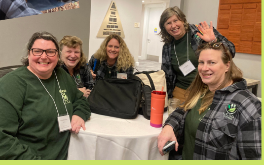
The unique collaboration of • Teachers • Garden • Nutrition • Contract Services Our model is a winner!