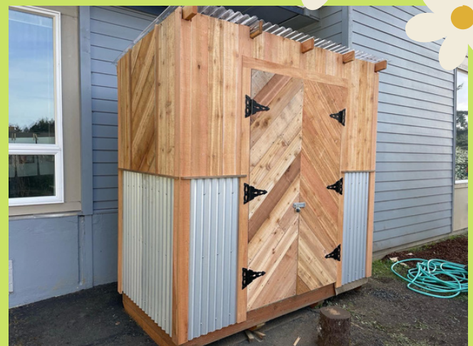
Custom Built Garden Shed for Sam Case Elementary