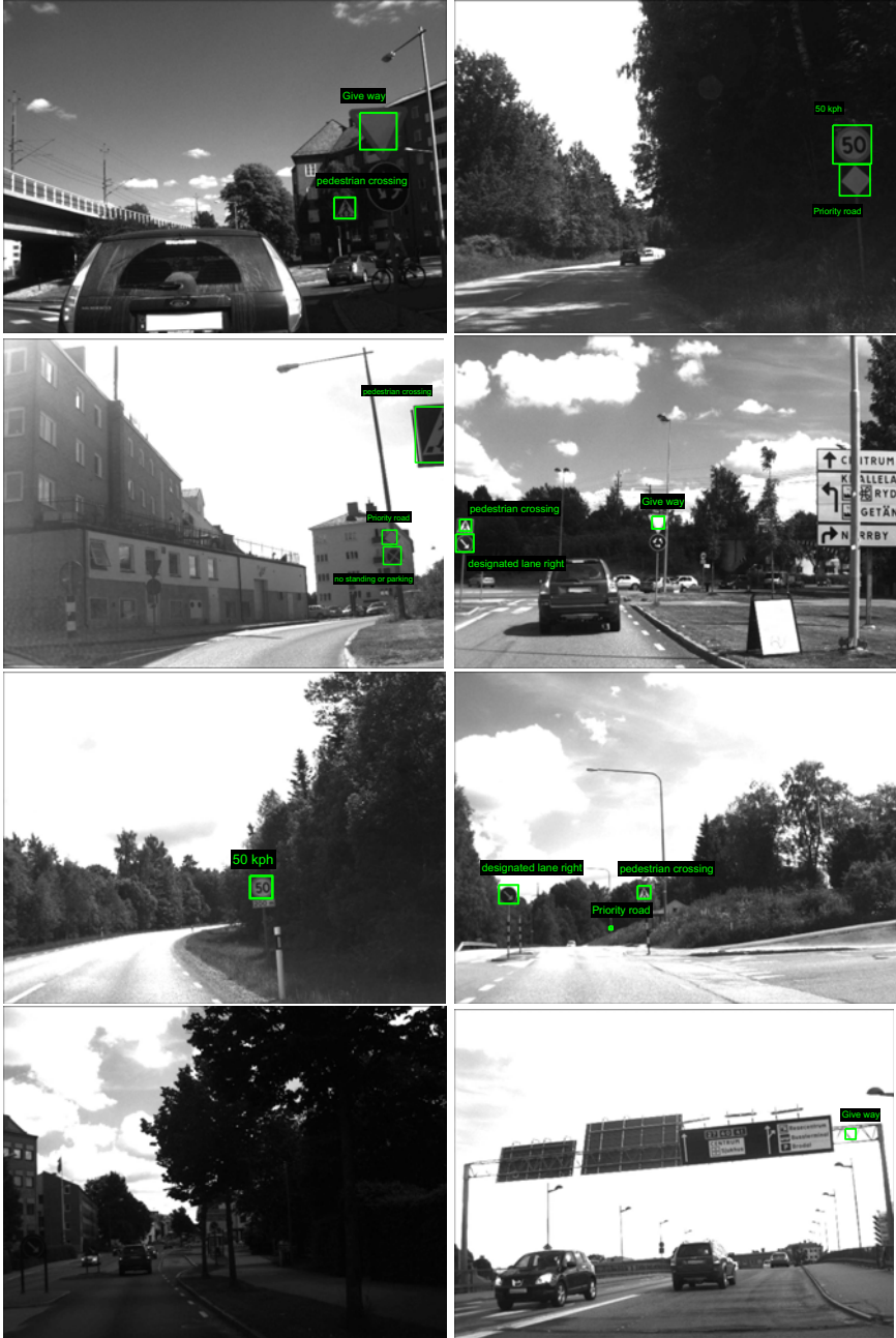
Fig. 6. The first three rows show examples of correctly detected signs. Bottom left shows an example of a missed detection and bottom right shows an example of a false positive, classified as a Give way sign.