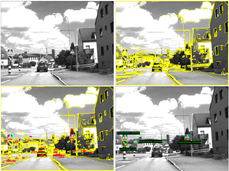
Fig. 3. Upper left: Query image. Upper right: Extracted contours. Lower left: Contours that matched any of the contours in the pedestrian crossing prototype are shown in a non-yellow color. Lower right: The final result after matching against all sign prototypes.

where \theta_k is a manually selected threshold for each prototype contour k , see fig. 3 lower left for an example of matched contours.