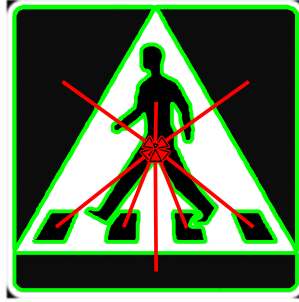
Fig. 2. Extracted local features (green contours) and corresponding vectors (red arrows) pointing towards the center of the traffic sign