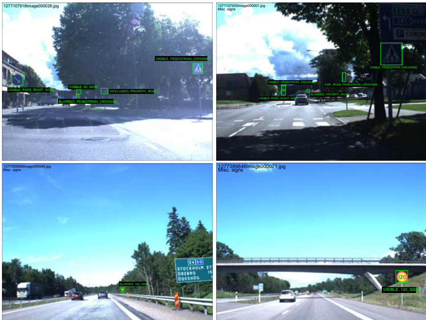
Fig. 4. Examples from the database

A human operator started the recording whenever a traffic sign was visible and stopped the recording when no more signs were visible. In total, in over 20 000 frames have been recorded of which every fifth frame has then been