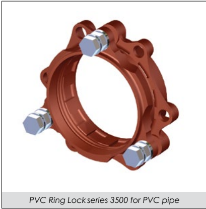
PVC Ring Lock series 3500 for PVC pipe

Mechanical Joint 360° Ring Type Restraint System Designed for C900 and IPS PVC Pipe Patent #5,947,527