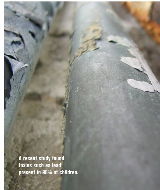
A recent study found toxins such as lead present in 96% of children.

Over 11 million parents, businesses, and healthcare professionals belong to the coalition Safer Chemicals, Healthy Families that advocates for the safer use of chemicals in homes, businesses, schools and household products. The coalition focuses on three areas to strengthen protection against toxic chemicals: stronger policies through advocacy; safer standards for retailers and manufacturers; and better information available to educate citizens. Safer Chemicals, Healthy Families also advocates for reform of the federal law Toxic Substances Control Act, which regulates the introduction of new or already existing chemicals.