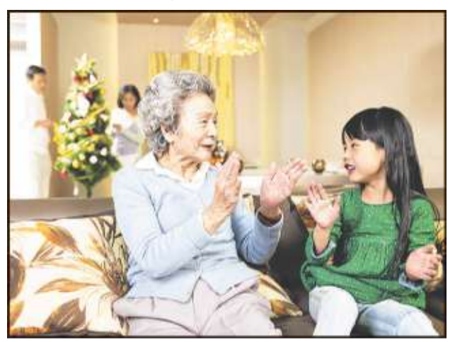
the installation of grab bars in grandparents' bathrooms and reinforced staircase bannisters around the house. Such a gift might not be as heartwarming as children's artwork in a specialty frame, but it is a practical and potentially lifesaving token of your love and appreciation.

· Home upgrades: Upgrades around a grandparent's home can vastly improve their quality of life, particularly if they've long since reached retirement age. Arrange for