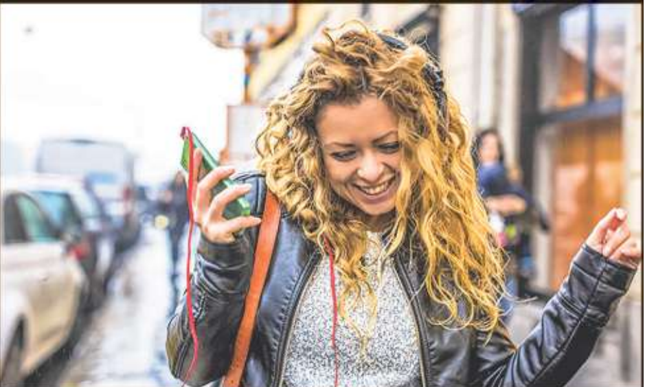
Photo history book: Browse a local bookstore and a you will find a range of books that are geared toward music fans. From biographies of famous artists to compilations of album cover art throughout the years to songbooks for aspiring musicians, there's shortage no

Purchase an instrument: Has а budding musician had his or her eye on an instrument upgrade? Sweep in and be the holiday hero by purchasing a brand new one according to the specs desired.