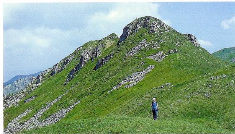
Green carpet, grey rocks: Monte Aquiletto, around which eagles still circle.

and steep forest paths and meadow trails; one passage requires sure-footedness and a head for heights.