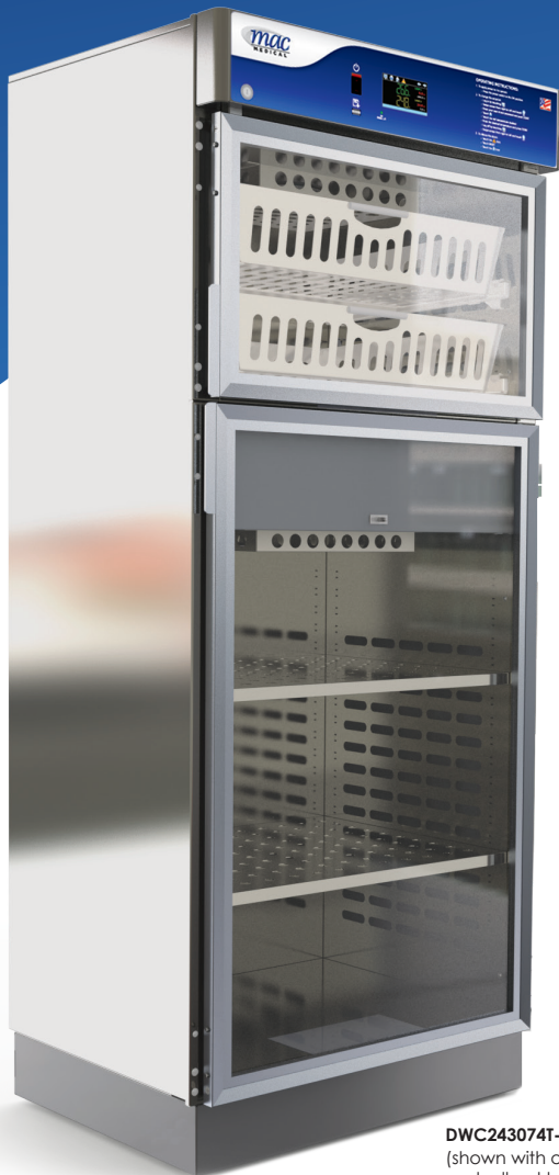
DWC243074T-TS (shown with optional glass doors and roll out baskets)

The TS-Series (Touch Screen) Blanket & Fluid Warming Cabinets provide the perfect blend of smart technology, value, and customer support in the industry. The intuitive touch screen gives you complete system control of your warmer, while the Ethernet/Wi-Fi capability allows remote connectivity (via smart phone app) giving you access to your warmer wherever you are.