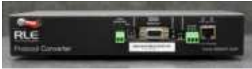
Protocol Converter - Single EIA-485 port