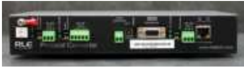
Dual Port Protocol Converter - Three EIA-485 ports

Thank you for purchasing a Protocol Converter. Before you begin to install and configure your device, consult rletech.com to ensure you're working with the most recent version of documentation for that product. The Protocol Converter User Guide is also available at rletech.com. If you need additional assistance, email our support staff - support@rletech.com, or call us at 800.518.1519.