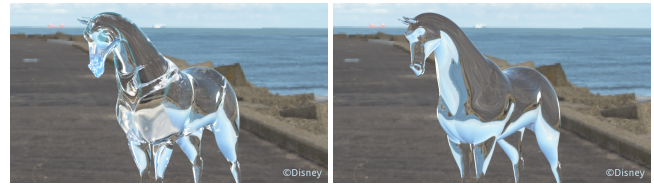
Figure 4: (left) Full refraction, (right) Single refraction

Each form of the Nokk, liquid or frozen, above or below water required its own lighting development and workflow. The lighting design was based on reality but heavily art directed, requiring multiple render passes, mattes generated by look and effects artists, and reflectivity rendered with and without refraction. The final look required a pass through compositing prior to review sessions with production design, visual development and the directors. We also modified Disney's Hyperion Renderer [Burley et al. 2018] to give us fine-grained control over the number of refraction steps, allowing us to simplify the read of important features like the face and ears.