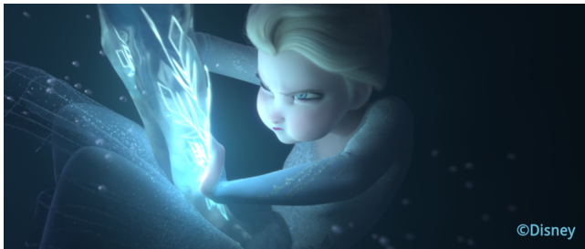
Figure 3: Transition from water to ice

Hoof interaction with the ocean surface was an important focal point, as there was a design goal to support the look of water interacting with water, as opposed to a hard surface interacting with water. Deformation and stretching was added to the legs by animators, and we further augmented this concept with simulations. To this end, particular attention was paid to the shapes of trailing water from the legs. These shapes were established by modeling our particle sources using smoothed trailing curves.