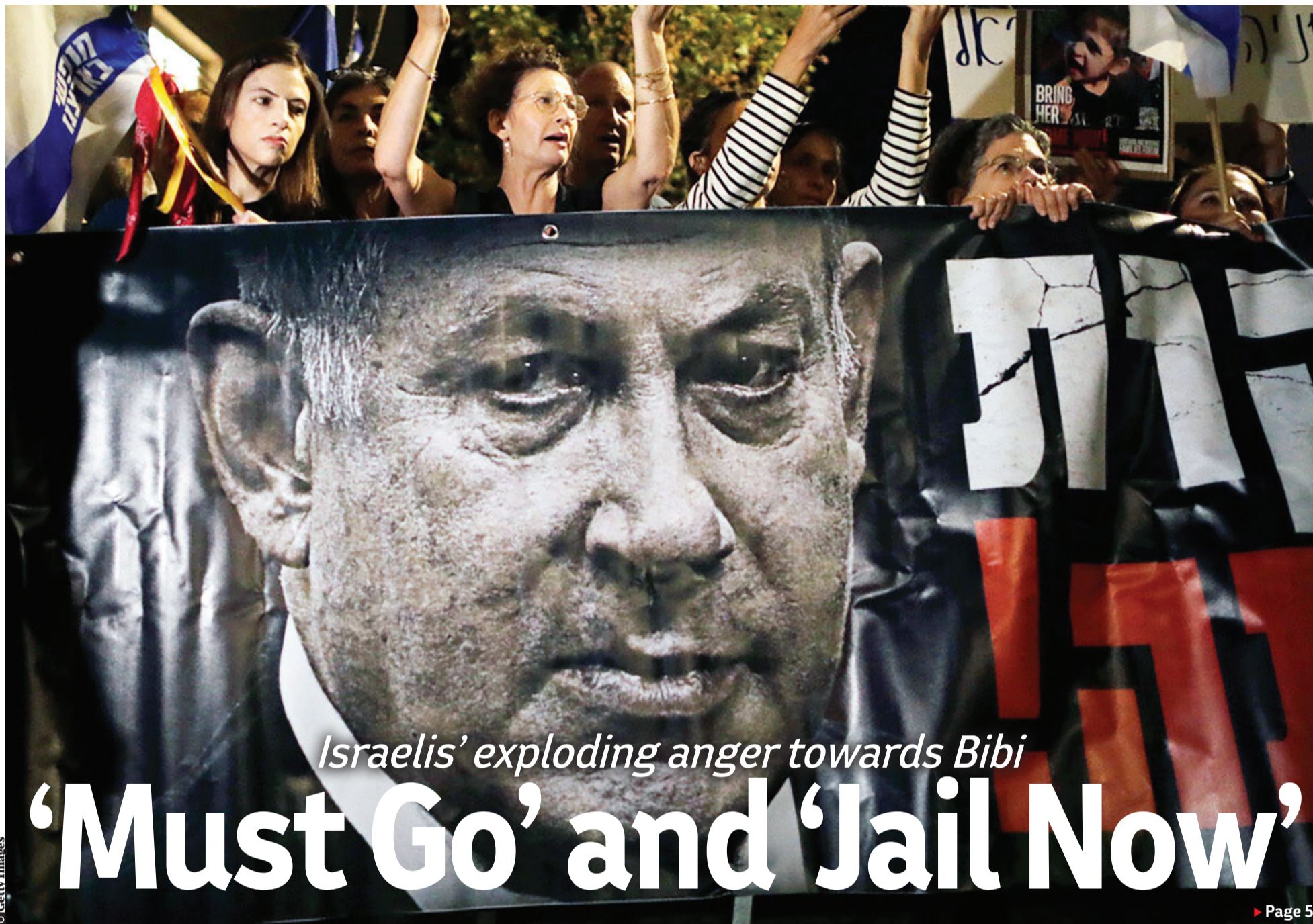
Israelis' exploding anger towards Bibi

8 Pages | Price 100,000 Rials | 1.00 EURO | 4.00 AED | 45th year | No. 14637 | Wednesday | November 15, 2023 | Aban 24, 1402 | Jumada al-Awwal 1, 1445