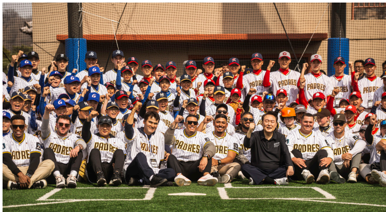
Clockwise from top: Ha-Seong Kim (left) and Woo-Suk Go (right) pose with Make-A-Wish kids; Children cheer as Padres arrive for free clinic; Players pose with baseball clinic participants.

Padres alum Chan Ho Park and players including Ha-Seong Kim, Manny Machado, Fernando Tatis Jr. and Jackson Merrill volunteered to teach little league players baseball fundamentals.