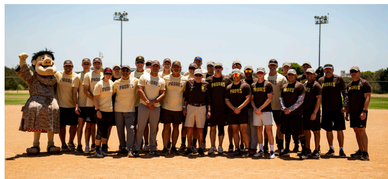
Top to bottom: Padres front office volunteers at the Padres' annual Military Care Package event; Marines at the Alumni Military Softball game; Padres Alumni and active military members at MCRD; A group of military moms-to-be with their new Nuna strollers and car seats.

The Padres provided more than 7,000 tickets to active-duty military, veterans and families in 2024. Support for local charity partners included the Hats Off Their Heads online auction of game worn and player-issued Independence Day caps. This generated $24,000, including a $10,000 donation from Blue Shield of California for military families supported by the Armed Services YMCA of San Diego.