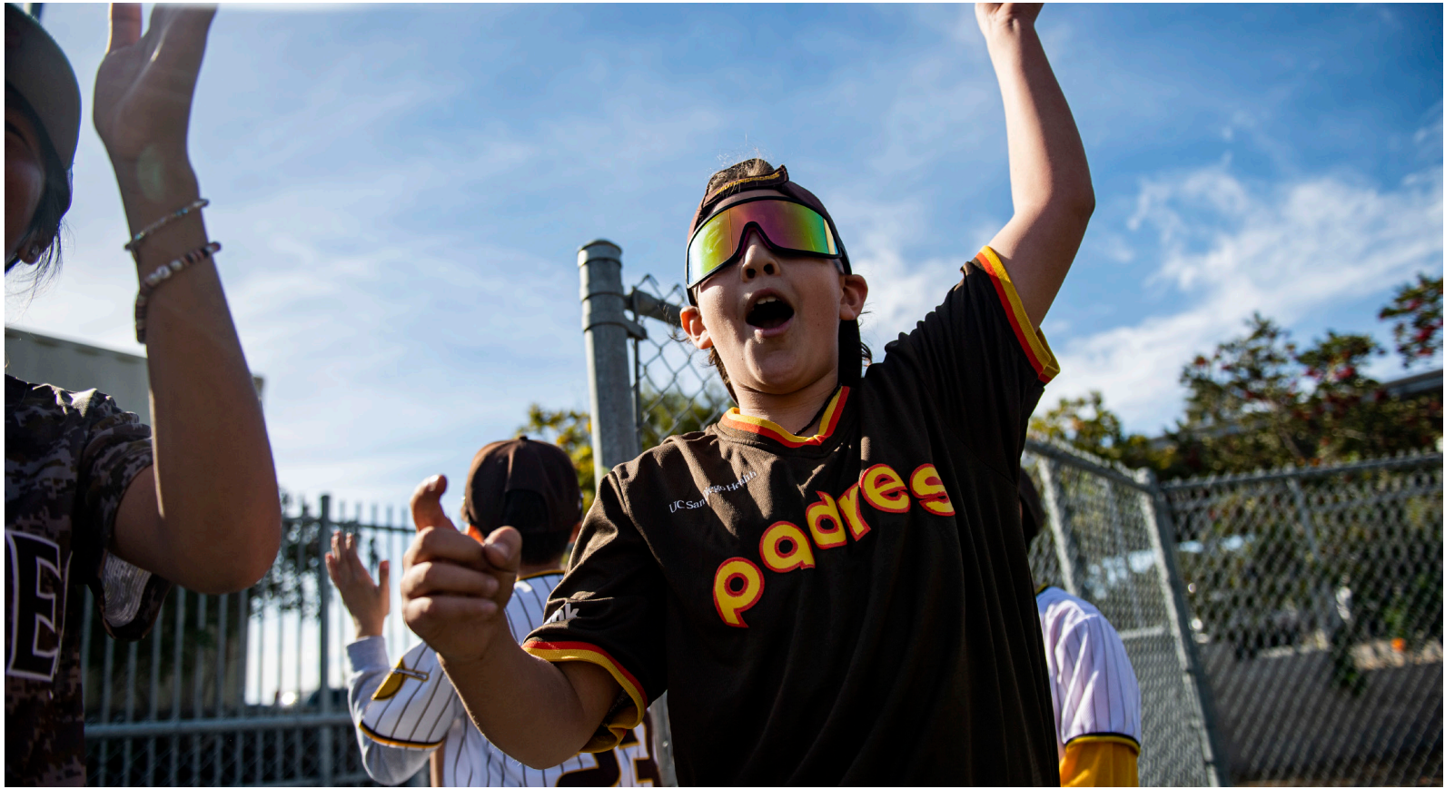
A Padres Rookie League player.