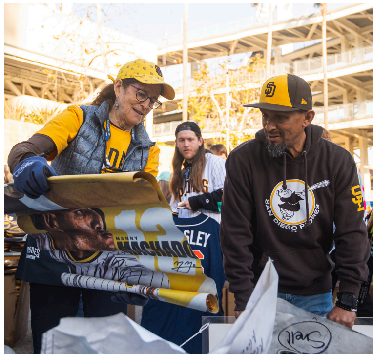
From top to bottom: Padres 2024 Fantasy Camp champions; Padres fans shopping at the annual Garage Sale

The Padres Foundation annually conducts a "garage sale" of unique items such as jerseys, bats, caps, game-worn items and other memorabilia. This sale occurs in conjunction with the Padres' annual FanFest.