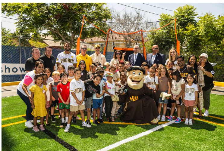
Top to bottom: Future Padres softball players getting ready for their Opening Day Ceremony; Estrellas program participants during batting practice at Petco Park; Xander Bogaerts helped unveil the new field at Burbank Elementary School.

volunteered by the Padres Volunteer Team