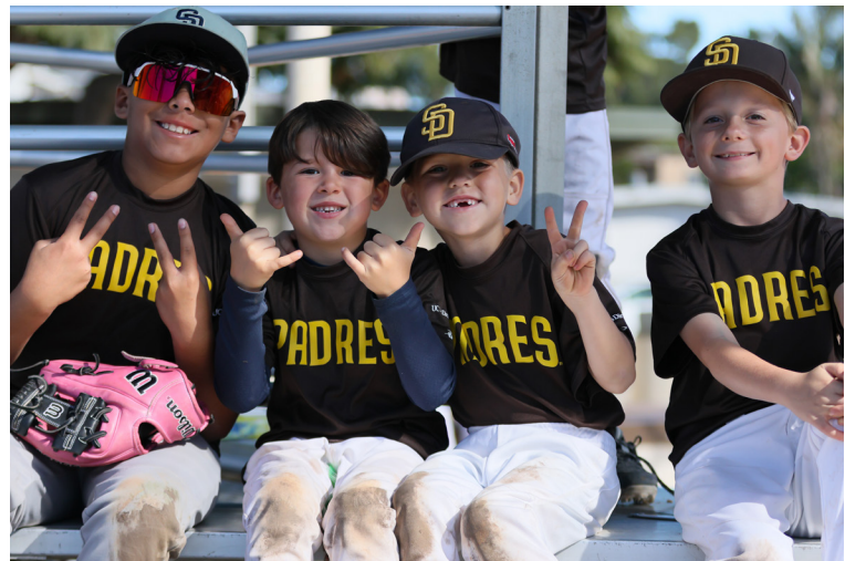
Top to bottom: Future Padres softball players getting ready for their Opening Day Ceremony; A young Padres Rookie Leaguer receiving a hitting lesson; A group of young fans enjoy their Padres Baseball Camp