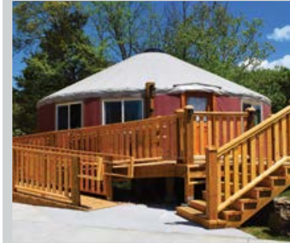
Table Rock State Park

Enroll in the Customer Rewards Program at a Missouri State Parks location or when speaking with the call center team, or update your online customer account at icampmo.com and visit mostateparks.com for more information.