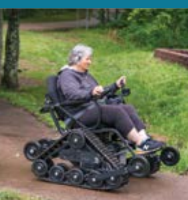
Elephant Rocks State Park

When making reservations, there are various options for payment, including credit cards, debit cards, camping coupons and gift cards. Check mostateparks.com for more information