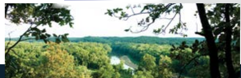
Castlewood State Park