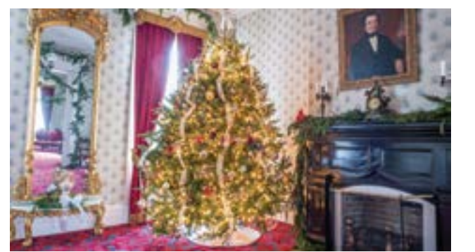
Hunter-Dawson State Historic Site