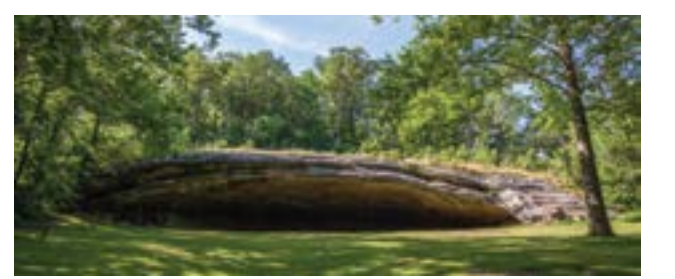
Graham Cave State Park