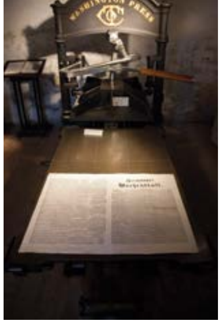
Deutsheim State Historic Site

DISCLAIMER: This map is not a legal survey. The Missouri Department of Natural Resources makes no warranty, expressed or implied, as to the accuracy of the data or related materials and is not responsible for any damage or loss resulting from its use.