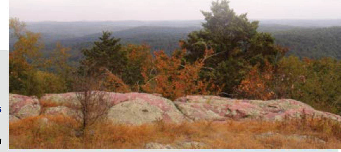
Johnson's Shut-Ins State Park