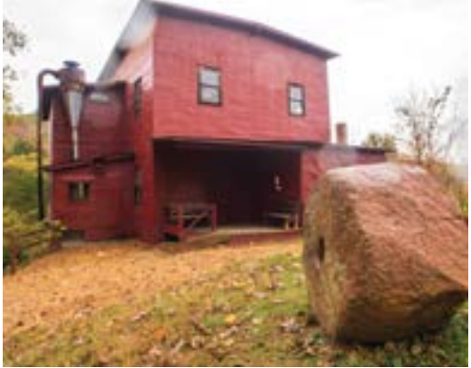
Dillard Mill State Historic Site