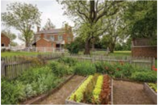
Watkins Woolen Mill State Historic Site

History is all around you at Missouri state parks, and each state park and state historic site has its own unique stories to tell. Visitors are encouraged to learn about the state's fascinating past as they tour the historic homes of famous Missourians, explore the settlements of early French and German immigrants, wander across somber Civil War battlefields, appreciate the enduring rustic architecture of the Civilian Conservation Corps, stroll across the landscape of an American Indian village, or learn about the many contributions of Missouri's Black Americans. Missouri State Parks preserves and interprets numerous examples of the state's most outstanding cultural landmarks, including buildings, structures and archaeological sites, many of which are recognized nationally for their historical significance. The Missouri State Parks system contains close to 240 properties listed on the National Register of Historic Places, either listed individually or as contributing features to one of 19 NRHP-listed historic districts, and boasts seven National Historic Landmarks.