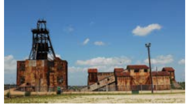
Missouri Mines State Historic Site