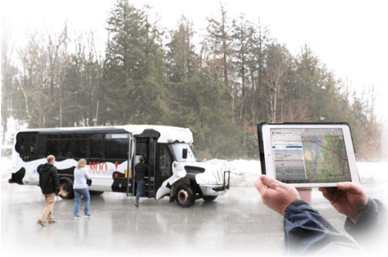
tablet displaying trip planning tool in front of VT Moover Bus

How it works: In partnership with Trillium and Cambridge Systematics, the Vermont Agency of Transportation (VTrans) has developed an online open-source trip planning application, which – by using GTFS-flex data – provides state-wide results that include more flexible transportation services such as dial-a-ride, hail-a-ride, and deviated fixed-routes. With this platform, users – particularly, non-traditional rural transit system users – gain a more complete picture of all their mobility options when planning a trip. The online platform was developed as a pilot project within the FTA MOD Sandbox program, and several other transit agencies have already