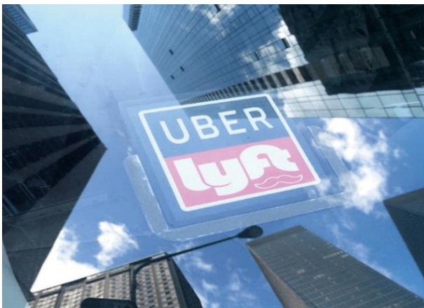
Uber and Lyft stickers on driver's windshield

How it works: The Arizona Health Care Cost Containment System (AHCCCS) announced a policy change effective May 1, 2019 that allows TNCs to register as NEMT medical transportation providers. Medicaid recipients in Arizona can use their benefits to pay for Lyft rides to and from medical appointments. AHCCCS stated that adding TNCs as NEMT providers “can add flexibility to the health care delivery system and increase transportation options for Medicaid members.” The policy establishes TNCs as a new AHCCCS provider category. However, these rides are only servicing people on Medicaid who do not require personal assistance during medically necessary transportation. This still leaves traditional NEMT providers to serve Medicaid