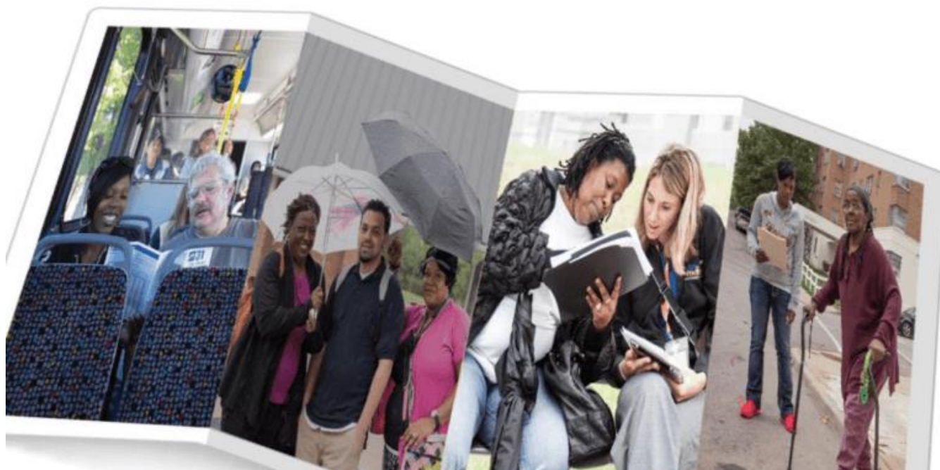
GoDakota Rideshare 101 Presentation Cover Slide.

How it works: Dakota County is located southeast of the Twin Cities, and while it is the third largest county in Minnesota, it maintains a land use mix of ⅓ urban, ⅓ suburban and ⅓ rural. In March 2019, Dakota County partnered with Lyft to offer flexible, on-demand rides to individuals with disabilities who receive home and community-based services in the county. These rides supplement existing transportation options and are aimed at making it easier for individuals with disabilities to access jobs and travel independently. The partnership is supported in part by a grant from the Minnesota Department of Human Services. Riders of the service do not pay for their trips out of pocket as the service is covered through Medicaid. As a result, the County tells Lyft the amount that should be uploaded to each user’s account and those funds are then applied to the trip. Response to the new program has been positive, with 75% of the users indicating that they are extremely satisfied with the service, as opposed to 60% of the users indicating that they were dissatisfied with the transportation options before the Lyft pilot. In addition to being more satisfied with the transportation options; 63% indicated that they were able to work more hours or days in a week, 69% indicated that they no longer had to rely on a friend or