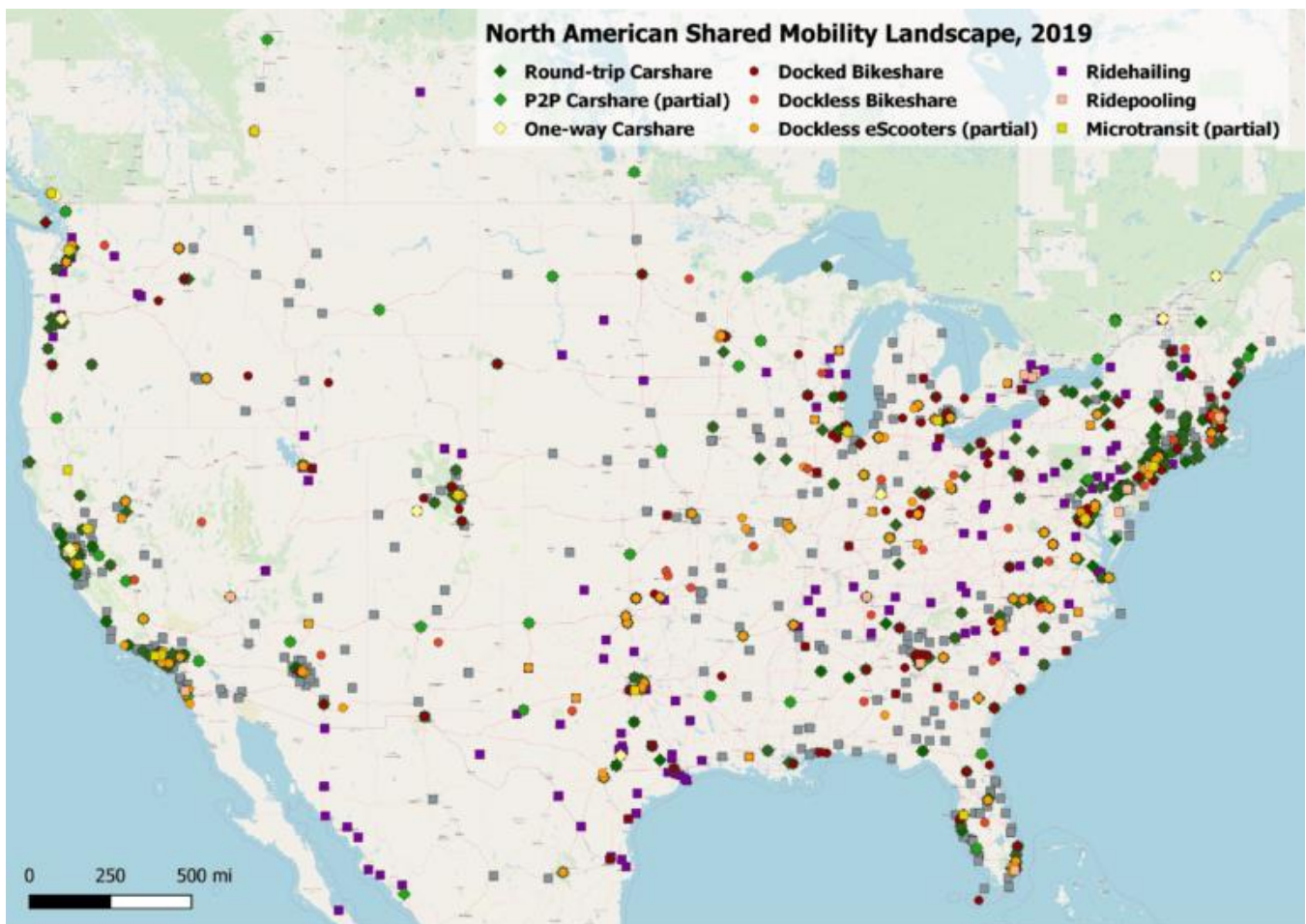
North American Shared Mobility Landscape, 2019.

The rise of shared-use mobility services across the country corresponds with growth of partnerships between shared-use mobility providers and public transportation agencies. However, some of these partnerships raise concerns regarding equitable access to services for people with disabilities. Additionally, descriptions of these partnerships do not consistently include reference to how the service impacts riders with disabilities. With an increasing number of public & private providers entering this space, policies and programs are needed to ensure that people with disabilities also have access to equitable shared-use mobility service with a high standard of quality. In response to this growing need, the former U.S. Department of Transportation Secretary Anthony Foxx published a “Dear colleague” FTA guidance in December 2016 , advising transit agencies that they are obliged to “ensure equity and access as you partner with TNCs.” The guidance clarified that ADA regulations apply regardless of federal funding and apply to public and private transportation providers. What’s more, demand-responsive service needs to be deemed “equivalent” to services provided to other individuals in the areas of: