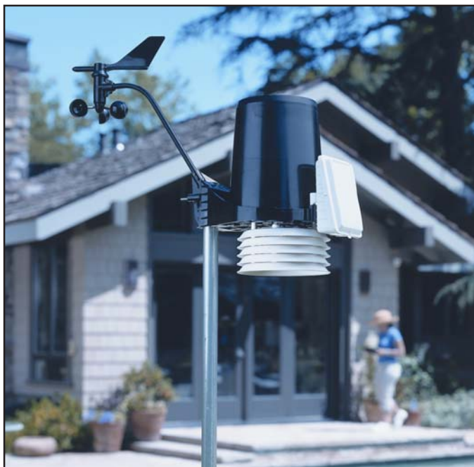
Vantage Pro2 Weather Station

The 100-6152C Vantage Pro2 Weather Station offers forecasting, on-screen graphing, and much more, all on a large 3-1/2" x 6" (90 x 150 mm) LCD display. Quick view icons show the forecast at a glance, sunny, partly sunny, cloudy, rain, or snow, while a moving ticker-tape display gives more details. Mostly clear with little temperature change? Increasing clouds and cooler with precipitation within four to six hours? Whatever the forecast, Vantage Pro2 will let you know. Backlit display for easy viewing. Mounts on desk, shelf, or wall. US and metric units of measure. Optional data logger must be ordered separately.