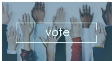
2021 Local Government Elections: Newsletter 2 Issue date: Friday 18 June

A total of 10 election specific newsletters were emailed to stakeholders including councils and candidates, from 28 May through to 9 September. The newsletters kept stakeholders up to date with topics ranging from nomination information through to details of vote counting. The newsletters were also available on the NTEC website and links were shared on the NTEC's Facebook page.