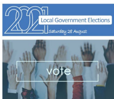
2021 Local Government Elections: Newsletter 2 Issue date: Friday 18 June

A total of 10 election specific newsletters were emailed to stakeholders including councils and candidates, from 28 May through to 9 September. The newsletters kept stakeholders up to date with topics ranging from nomination information through to details of vote counting. The newsletters were also available on the NTEC website and links were shared on the NTEC's Facebook page.