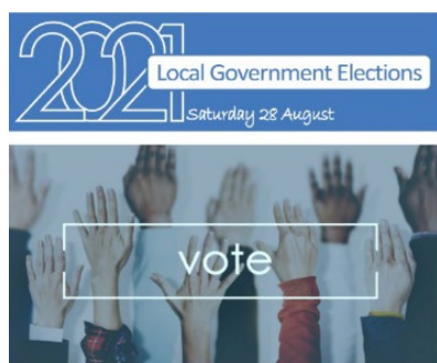
2021 Local Government Elections: Newsletter 2 Issue date: Friday 18 June