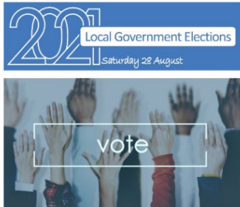
2021 Local Government Elections: Newsletter 2 Issue date: Friday 18 June

A total of 10 election specific newsletters were emailed to stakeholders including councils and candidates, from 28 May through to 9 September. The newsletters kept stakeholders up to date with topics ranging from nomination information through to details of vote counting. The newsletters were also available on the NTEC website and links were shared on the NTEC’s Facebook page.