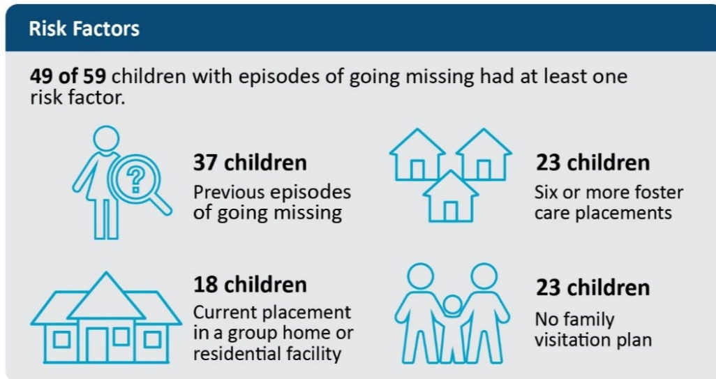
Exhibit 2: Most of the children had at least one risk factor associated with increased likelihood of going missing from care.