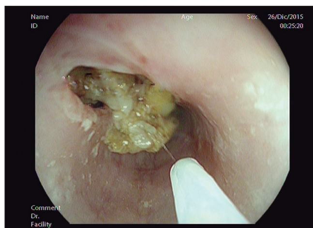
Fig. 1. Endoscopic image. A foreign body in the lower third of the esophagus.

Boerhaave's syndrome is a rare syndrome, but with high mortality (35%). Mackler triad is very characteristic: vomit-