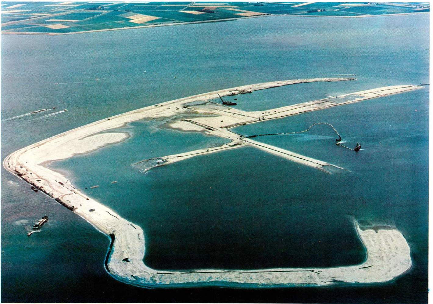
The island at Juli 1977.

On the island, roads will be built for the construction traffic, the width of the roads varies from 3,5 m. on the inside of the ringdike and 5,50 to 6 meter around the excavation and work area. The height of the ringdike around the excavation varies from + 5,50 N.A.P. on the east side to + 7,50 N.A.P. on the west side. The area around the excavation will be built up to + 2 N.A.P.