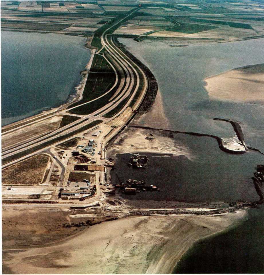
Photo left: Workharbour at Grevelingendam under construction. Photo below: Artificial island under construction (April 1977).

Because of the tight time schedule until 1983, 'Holland' B.V. started in February 1977 to create an artificial island of 1000 x 550 m. on the Plaat van de Vliet, a tidal sandbank between the current streams the Krammer and the Slaak.