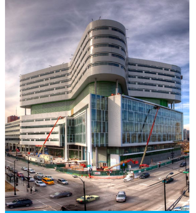
Rush University Medical Center, Chicago, IL

To address this gap, a series of tests were conducted to evaluate the performance and bending capabilities of ROCKWOOL stone wool insulation boards at various curvature radii (Figure 1). These tests aimed to determine the minimum allowable installation radius for each configuration.